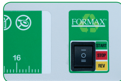
Simple push-button operation

Protects Shipments: Perforated cardboard netting is flexible, shock-absorbing cushioning which can be wrapped around products to protect from all sides. It can also be used to fill empty space in shipping boxes.