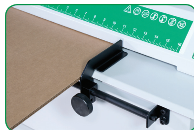
Trim to the size needed and save the rest to reuse