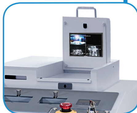
Recording System internal and external cameras to monitor input and output of drives for optimal security

Formax - New Hampshire, USA www.formax.com