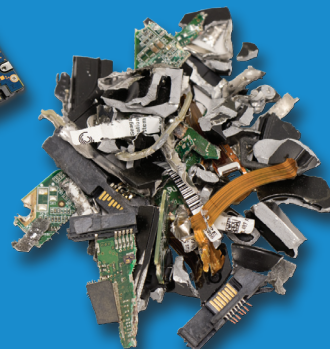
2.5" HDD & SSD Hard Drives Shredded with the FD 87HDS-R