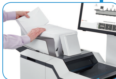
High-Capacity Envelope Feeder