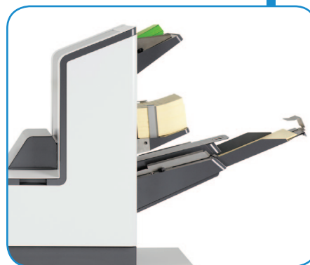
Tower Feeder with Accumulation/Divert Deck

Formax - New Hampshire, USA www.formax.com