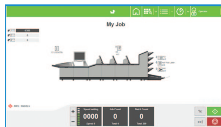
22" Color Touchscreen Interface