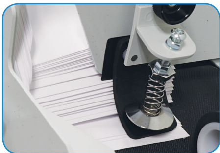
Envelope separator ensures single feeding

Options: FD 430-10 Extended Sealing Kit for flaps up to 4" long, FD 430-20 Square Flap Moistening Basin and Roller