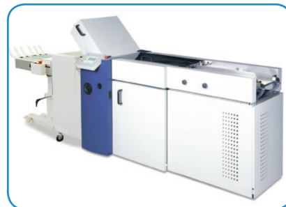
FD 2300 air-feed