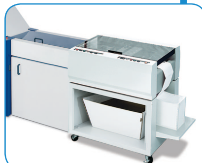
FD 2380 with in-line FD 676 Burster