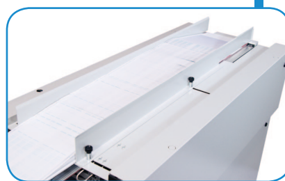
FD 2300-EXT extended air-feed

Formax – New Hampshire, USA www.formax.com