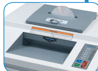
Two dedicated feed openings for paper, CDs/DVDs, USB thumb drives