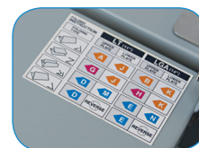
Clearly marked fold guide for quick and easy setup