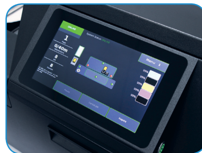
Full-color touchscreen control panel