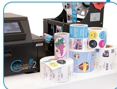
Compatible with a variety of label stocks, 1600 dpi resolution produces crisp text and images with vibrant color

Formax - New Hampshire, USA www.formax.com