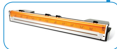
Memjet Inkjet Print Head features 74,000 nozzles and no moving parts