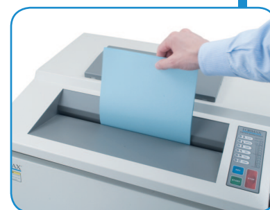
Standard Infeed accommodates up to 24 sheets at once

Formax - New Hampshire, USA www.formax.com