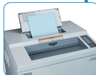
Dedicated AutoFeeder holds up to 175 sheets