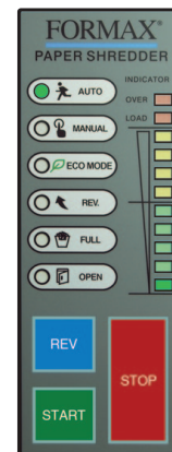
Easy-to-use control panel with Load Indicator and ECO Mode

* Sheet capacity varies depending on paper and power supply