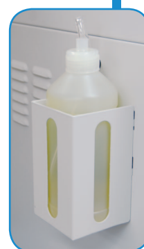
AutoOiler - Automatically pumps oil onto cutting blades