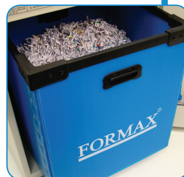
Lifetime Guaranteed Heavy-Duty Waste Bin