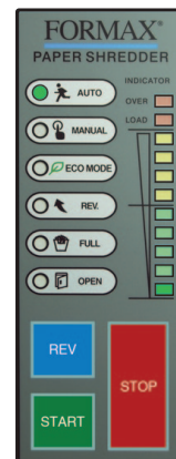
Easy-to-use control panel with Load Indicator and ECO Mode

Safety Circuit Breaker: Ensures safe operation