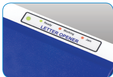
LED status indicators