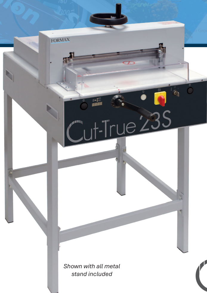
Shown with all metal stand included