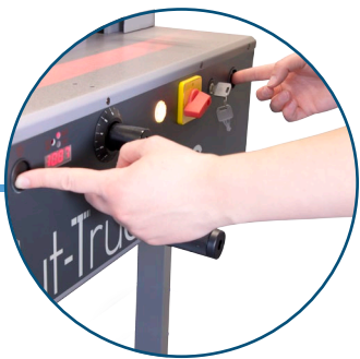
Two-Hand Operation Safely engages clamp and blade, keeping hands away from the cutting area