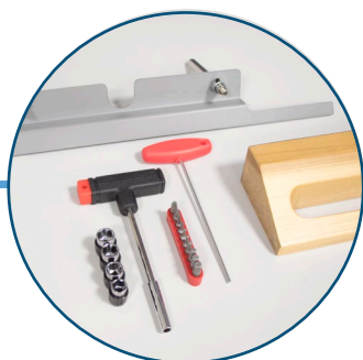
Blade Change Safety Tool Kit Change blades safely and easily, and make adjustments