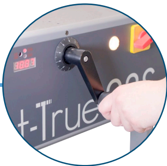
Manual Back Gauge Adjustment Fine-tune control for precision cutting