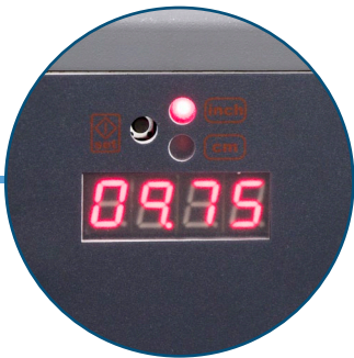
LED Back Gauge Display Get a precise cut using standard or metric settings