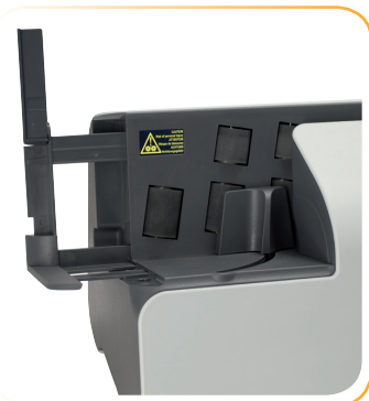
Easy-to-use support arm extends to hold large envelopes